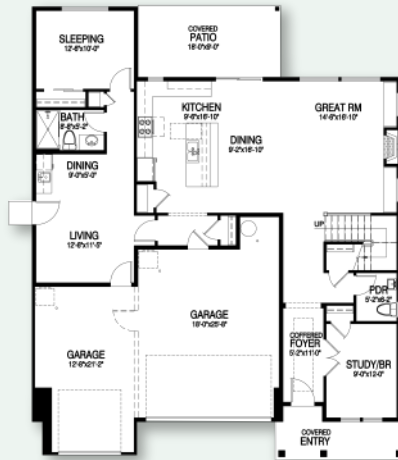
MAIN LEVEL (Elevation A&B)