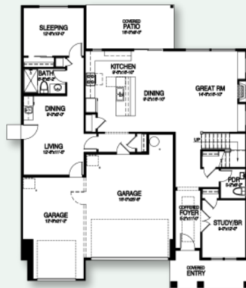
MAIN LEVEL (Elevation D)